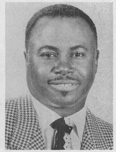
"The Crown Prince"

The Fields orchestra, which has been classed with Duke Ellington and Stan Kenton, features a variety of